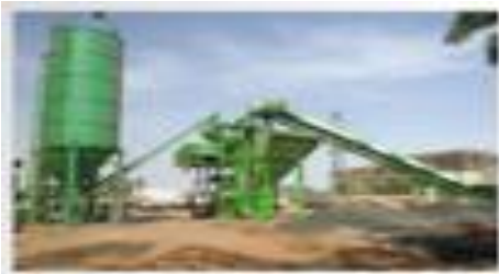
CP 30 Batching Plant at Ahmedabad Mega metro Rail Project

Mobile plants are for those customers who would like to move the plant from project to project quickly.