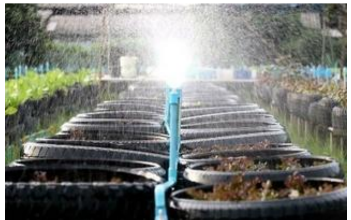
Grey Water Usage

Demand on conventional water supplies and pressure on sewage treatment systems is reduced by the use of greywater. Reusing greywater also reduces the volume of sewage effluent entering water courses which can be ecologically beneficial. In times of drought especially in urban areas, greywater use in gardens or toilet systems helps to achieve some of the goals of ecologically sustainable development.