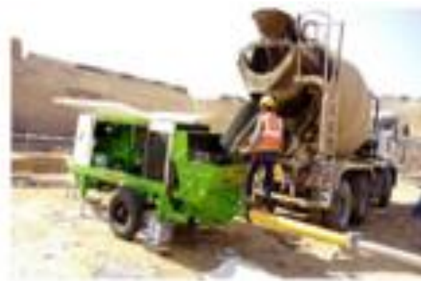
SP 1800 concrete pump and AM6SHNRHV Concrete Mixer at Gift City Canchi Nagar