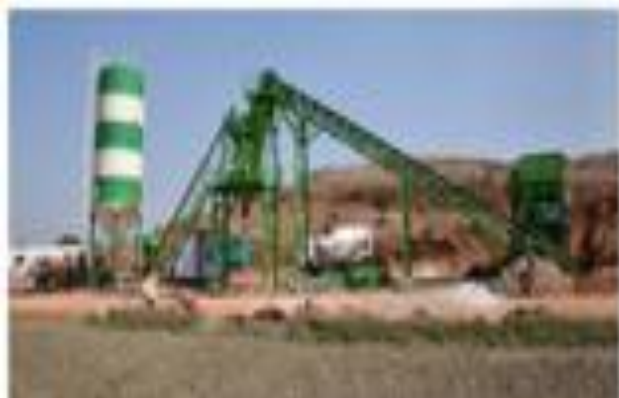
H1J Horizontal Batching Plant with AM/SHC Transit Mixers for Road Upgradation (Khanlyadana-Kadvaya-Gudar), Madhya Pradesh Project

Schwing Stetter is an organization which is capable of meeting the demand arising in infrastructure development where concrete is involved. Our presence is very strong in concrete road construction, construction of Dedicated Freight corridors for railway, metro rail construction, high rise construction, hydropower plant construction, dam construction for irrigation and power and in real estate projects besides a variety of power projects like thermal, nuclear, solar and gas based. We are strongly present in Windmills. In infra growth concrete road plays a major part.