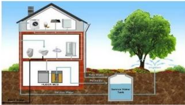
The system of grey Water Usage

In addition to providing a dependable, locally-controlled water supply, water recycling provides tremendous environmental benefits. By providing an additional source of water, water recycling can help us find ways to decrease the diversion of water from sensitive ecosystems. Other benefits include decreasing wastewater discharges and reducing and preventing pollution. Recycled water can also be used to create or enhance wetlands and riparian habitats.