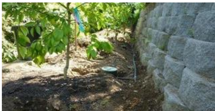
Basic grey Water system

Greywater is water from basins, baths and showers that is piped to a surge tank. The greywater is held briefly in the tank before being discharged to an irrigation or treatment system. The greywater can be diverted either by gravity or by using a pump.