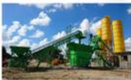
M I C –Mobile Batching Plant at Embassy it Park Pallavaram

A lot of costs is involved in the construction of the foundation and other infrastructure. Mobile plants keep such