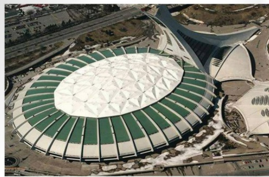
Arunabha Dey, National Manager-Waterproofing & Roofing

The need for efficient infrastructure is rising, and further challenges like sufficient supply of drinking water or intelligent use of limited resources are omnipresent. At the same time sound waterproofing solutions come as a very important aspect for safe and durable construction.