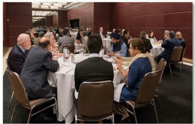
Farewell Dinner at RACV City Club