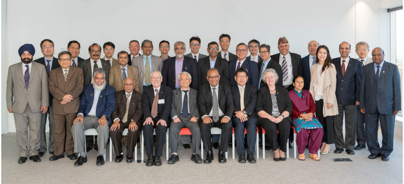
35 th Executive Committee Meeting of ACECC held at Melbourne from 8 th to 9 th October, 2018 in which ICE(I) also participated. This is a group photograph of the Members from the different countries who are Member of ACECC.